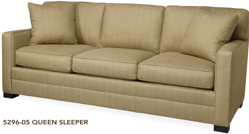
5296-05 QUEEN SLEEPER