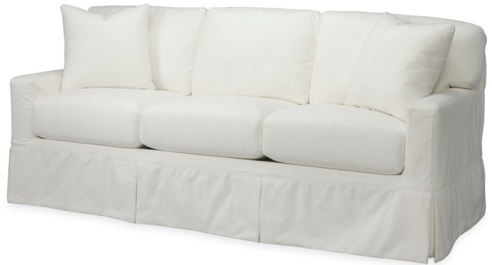
C5296-05 QUEEN SLEEPER SHOWN WITH OPTIONAL TOPSTITCHING

SLEEPER MATTRESS IS A PREMIUM QUILTED 5-1/2" INNERSPRING SLEEPER UNIT