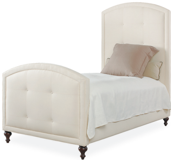
ARCH HEADBOARD & FOOTBOARD TWIN SIZE

TALL HEIGHT WITH WAFFLE TUFT PANEL, WELTED BORDER AND ROUND LEG