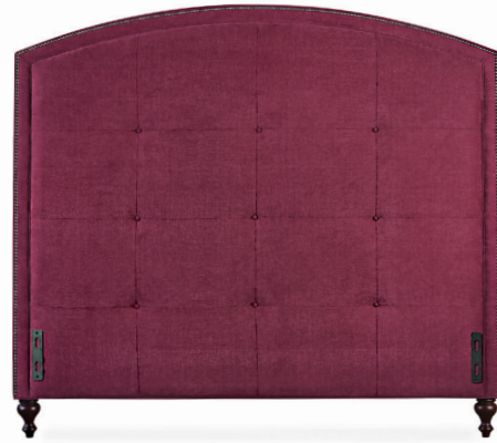
STYLE "A" - ARCH

LEATHER IS STANDARD WITH SEAMS ON HEADBOARD, FOOTBOARD AND RAILS.