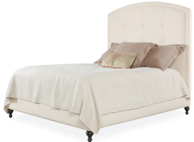
ARCH HEADBOARD & RAILS QUEEN SIZE

TALL HEIGHT WITH WAFFLE TUFT PANEL, WELTED BORDER AND ROUND LEG